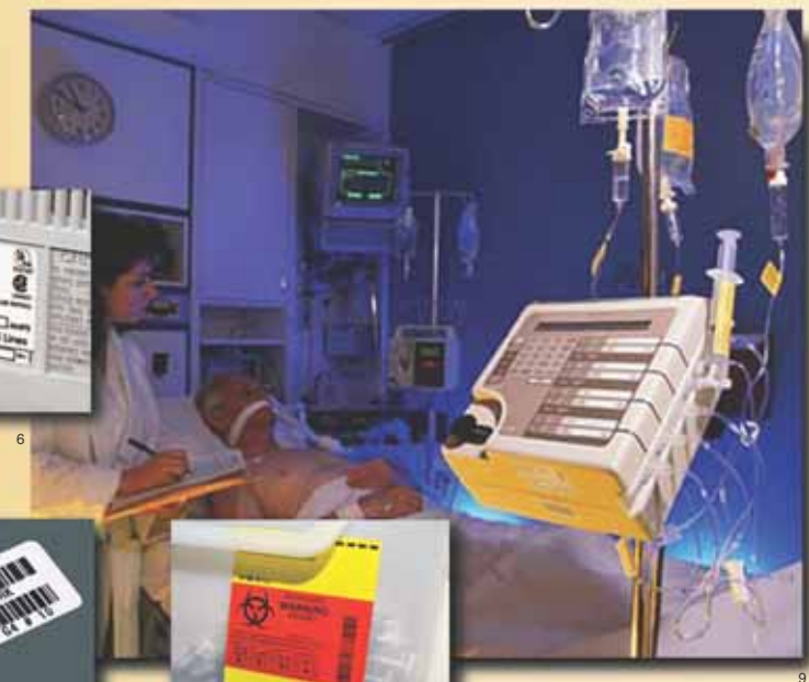
Warnings and directions

Complete, instruction and warning labels.